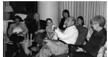
Ervin Staub discusses strategies to promote reconciliation before and after group violence.