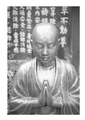
from everything, and studying Buddhist philosophy, among others.

The spiritual practices viewed as most fundamental in contributing to resilient growth consisted of chanting Nam Myoho Renge Kyo, striving simultaneously to attain enlightenment for self and others, taking personal responsibility for one's life, believing in the equality and dignity of all life, determining to create value