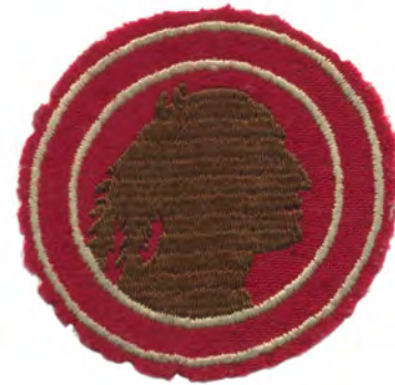
ECCR2 WHT C RED N/A N/A ~1930s Comments: 63 mm felt patch; BRN TYE Native American head emblem; No camp name; Awarded to scout whose overall score on 10 characteristics is in the top 2/5 of the entire camp; Gauze back; Circa 1930s