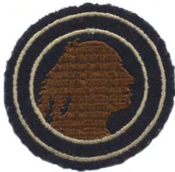
ECCR3 WHT C DBL N/A N/A ~1930s Comments: 63 mm felt patch; BRN TYE Native American head emblem; No camp name; Awarded to scout whose overall score on 10 characteristics is in the top 1/5 of the entire camp; Gauze back; Circa 1930s