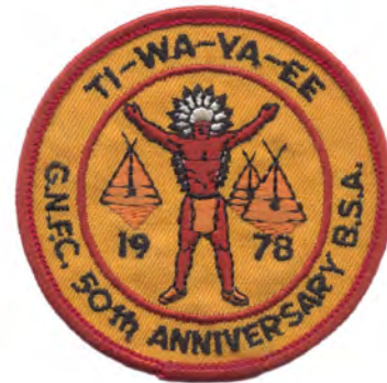
GNFCR6 ROR R ORG BLK BLK 1978 Comments: BSA; 78 mm; BLK "G.N.F.C 50th Anniversary"; RBR Native American; ORG Teepees; TR; BLK 1978. Gauze backing.