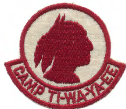
ECCX2 RED C WHT RED N/A ~1940s Comments: 78 x 67 mm RED TYE Native American head emblem w/attached rocker (camp name); No Twill; circa late 30s/early 1940s. Gauze backing.