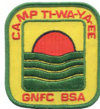
GNFCX5 GRN R YEL ORG ORG 1979 Comments: BSA; 78 x 86 mm; ORG GNFC; GRN landscape & ORG sun. Final patch. Camp was closed and sold. Plastic backing.