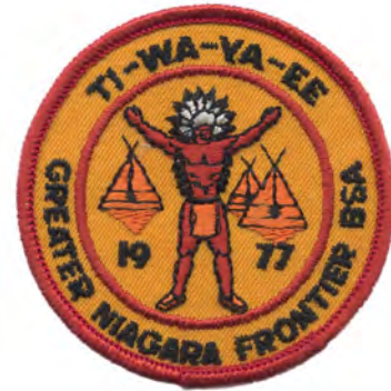
GNFCR5 ROR R ORG BLK BLK 1977 Comments: BSA; 78 mm; BLK "Greater Niagara Frontier"; RBR Native American; ORG Teepees; TR; BLK 1977. Gauze backing.