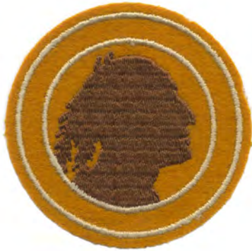
ECCR1 WHT C DYL N/A N/A ~1930s Comments: 63 mm felt patch; BRN TYE Native American head emblem; No camp name; Awarded to scout whose overall score on 10 characteristics is in the top 65% of the entire camp; Gauze back; Circa 1930s