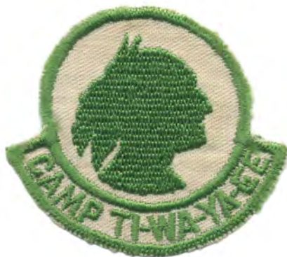
ECCX1 GRN C WHT GRN N/A ~1940s Comments: 78 x 67 mm GRN TYE Native American head emblem w/attached rocker (camp name); Twill Right; circa late 30s/early 1940s. Gauze backing.