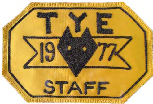
GNFCX3 DYL C DYL BLK N/A 1977 Comments: 154 x 102 mm; Octagon; BLK "TYE", "Staff", & 1977. Embroidered onto DYL fabric. Staff piece.