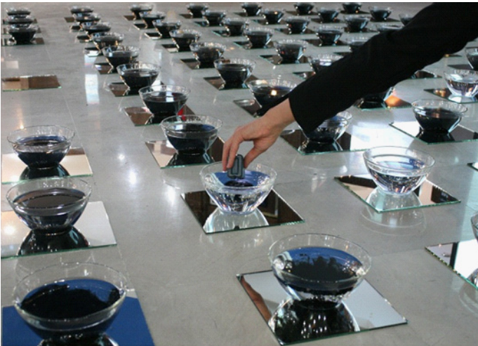
Tehran Peace Museum