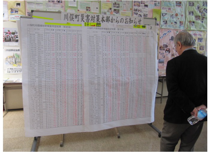
List of radiation levels at various places