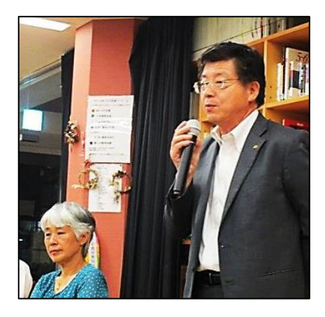
Report by the Peace Memorial Museum on Wartime Pioneers of Manchuria and Mongolia

There are two consultative organizations of peace museums in Japan, i.e. the Association of Japanese Museums for Peace (AJMP) and the Japanese Citizens' Network of Museums for Peace (JCNMP). AJMP, an affiliation of 10 relatively large-scale peace museums, recently created a set of panels for a travelling exhibition commemorating the 70<sup>th</sup> year anniversary of the termination of WW2.