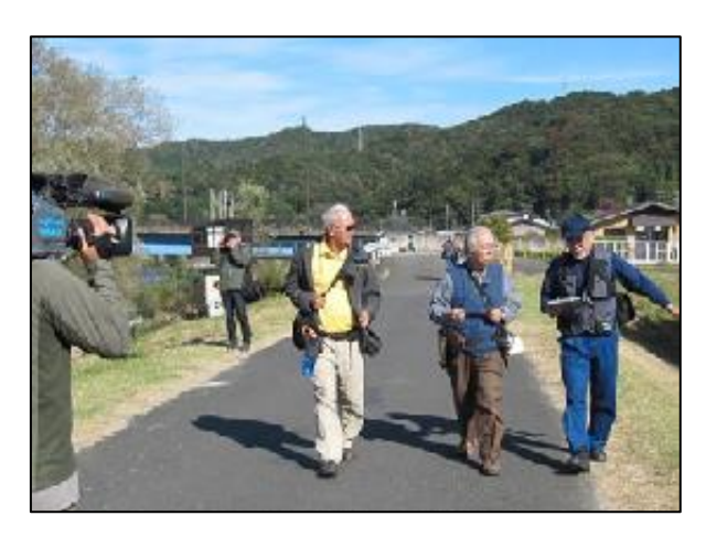
Radiation Research Work in Fukushima.

The ongoing updates at the Kyoto Museum for World Peace based on the Fukushima Team's investigation illustrate how museums for peace everywhere can refresh their exhibits to showcase exemplary contemporary efforts in peacebuilding, rebuilding trust and restoring justice. The traveling photo exhibition also demonstrates how museums for peace can extend their reach to educate and inform audiences beyond their place-based geographic locales.