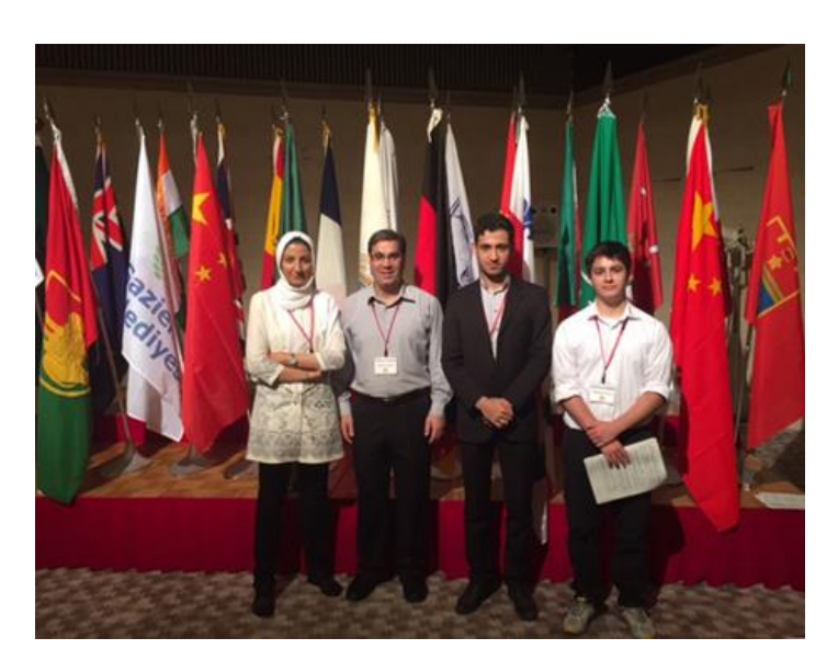
TPM representatives at the International Youth for Peace Conference

The Iranian team gave a presentation during the opening ceremony of the conference on the role of youth in promoting a culture of peace in Iran. Participants were youth representatives from 23 cities including Bangkok, Hanoi, Hanover, Izmir, Manchester, Montreal, St. Petersburg, Verona, Volgograd, Wellington, as well as Hiroshima and Tehran. To read more about distinguished visitors at the TPM and other events such as the second series of the Peace Counts workshops, as well as the fourth UN Security Council simulation; and also a series of events to commemorate International Day of Peace (21st September), please refer to the website. It should also be mentioned that the TPM accepts qualified interns.