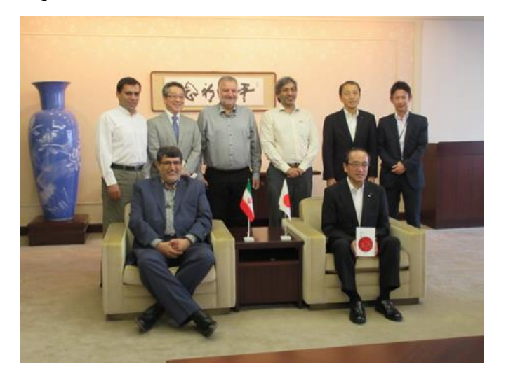
Meeting of TPM representatives with Hiroshima Mayor Kazumi Matsui

programmes with a focus on the role of chemical weapons survivors in educating people for a culture of peace.