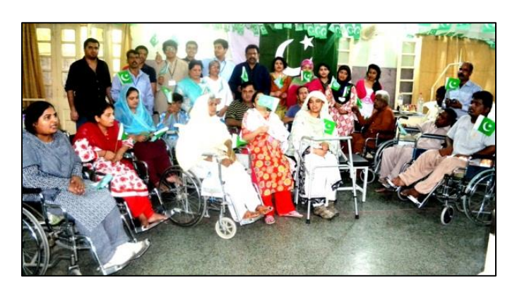
At St. Joseph's Hospice