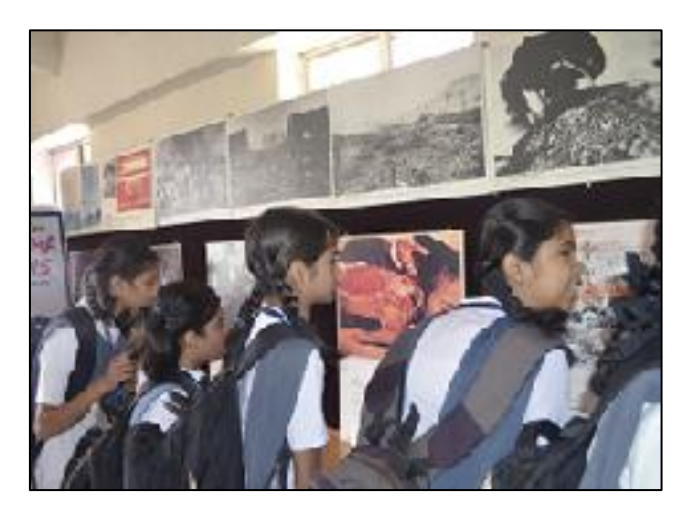
Exhibition at Peace Museum in Nagpur

The environmental consequences of a limited regional war between India and Pakistan would devastate much of the sub-continent, and also gravely affect South Asia and even the entire planet because of the onset of nuclear winter. Because of mistrust, misunderstanding, and animosity between India and Pakistan the danger of a nuclear war being unleashed, deliberately or accidentally, is real and it is therefore of the utmost importance that especially young people are being made aware of these risks, and the need to prevent such a war, not least by working for the abolition of nuclear weapons. During these presentations, both students and teachers showed a keen interest and raised many questions.