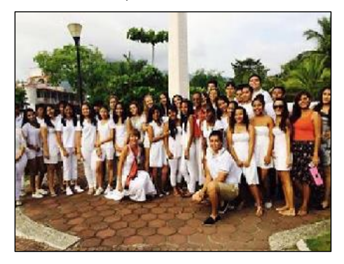
In Zihuatanejo, Mexico, thousands of children are the beneficiaries of a "rice and beans" programme that refurbishes school rooms and provides lunches for poor children