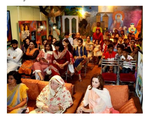
Certificate Distribution at I-LAP Peace Museum

surroundings. The I-LAP Internship Programme concluded with a Certificate and Award Distribution Ceremony.