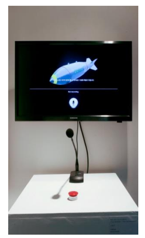
Final Decision-Your Last Statement by Go Chang Seon