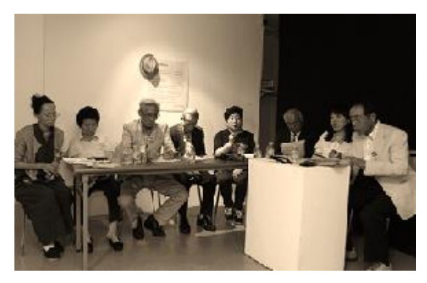
Korean and Japanese A-bomb Victims meeting in Seoul

Korean A-bomb victims are waiting for the National Assembly to enact a special bill that will include provision of support for victims through medical aid and other measures of assistance. Meanwhile, the Supreme Court of Japan confirmed judgment in the suits of Korean victims against the city of Osaka, Japan. It was ruled that it was unjustified for them to be denied full compensation because they are not now living in Japan.