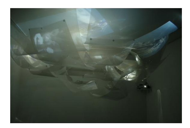
Eternal Light-Lost Paradise by Han Ho

Korea has the second largest number of A-bomb victims after Japan: Approximately 700,000 people were victimized by the A-bombs, the number of Korean victims is assumed to be around 70,000 or 10% of all victims. Countless Koreans who were living in Japan at the time due to brutal colonial exploitation and forced labour policies became victims when the atomic bombs were dropped on Hiroshima and Nagasaki. Not only did they kill many people, but the after-effects of the bombings run in the victims' families even now.