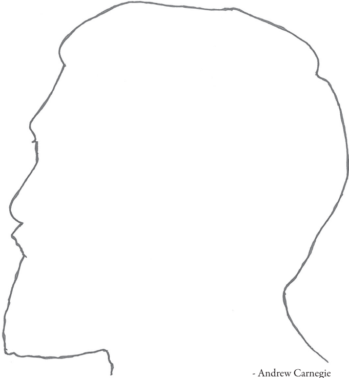
- Andrew Carnegie

“To try to make the world in some way better than you found it, is to have a noble motive in life.”